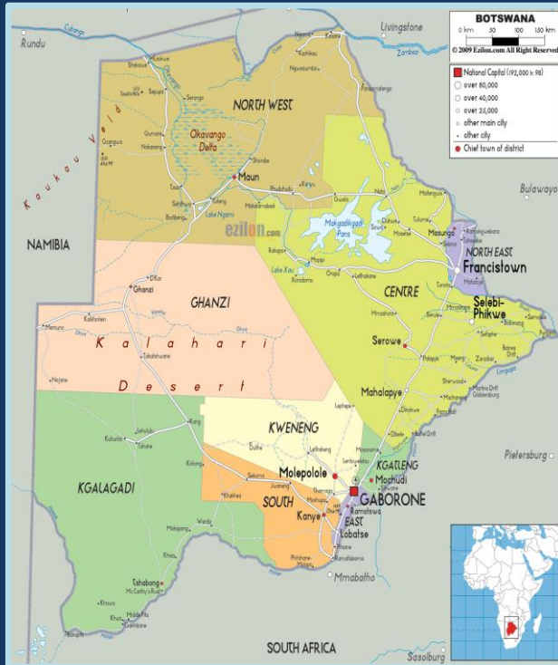
Map of Botswana